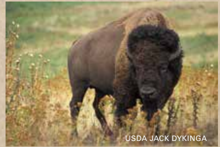
USDA JACK DYKINGA