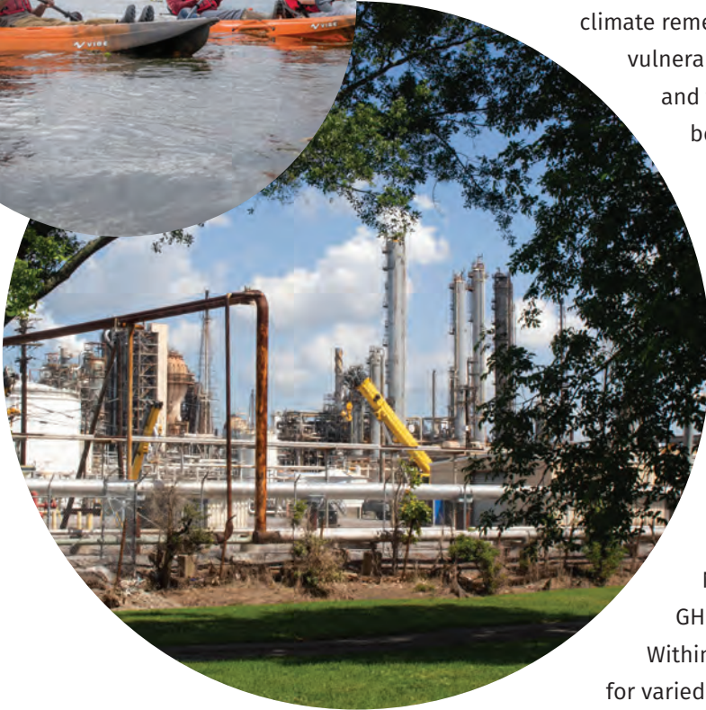
Photos: Top left: EPA exploring New Orleans waters with community members. Photo by Eric Vance, US EPA; Bottom right: Louisiana Infrastructure. Photo by Emily Clarke

As the second largest emitter of GHGs after China, the US released about 5.8 billion tons of GHGs in 2019.