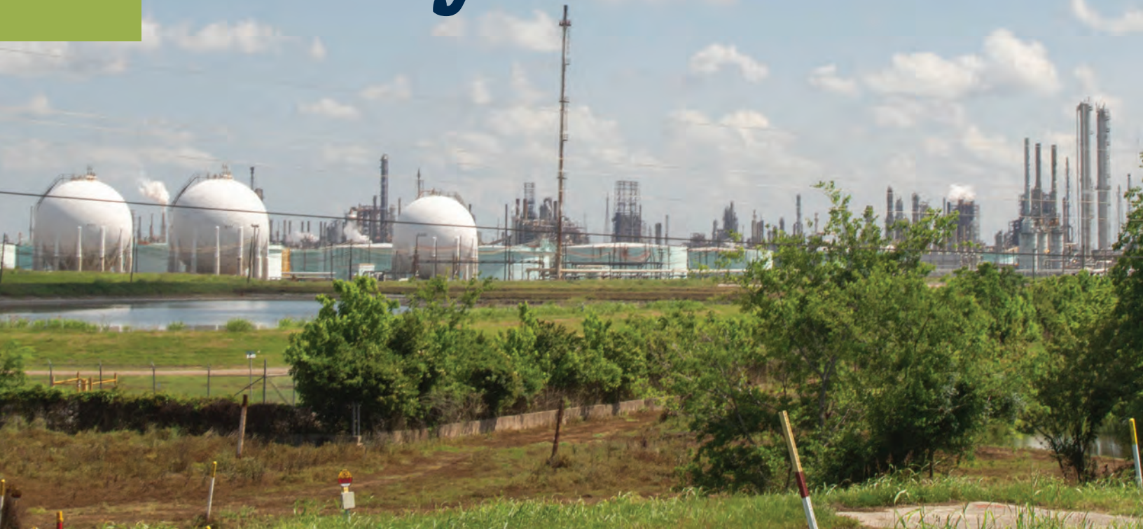
Louisiana Infrastructure.