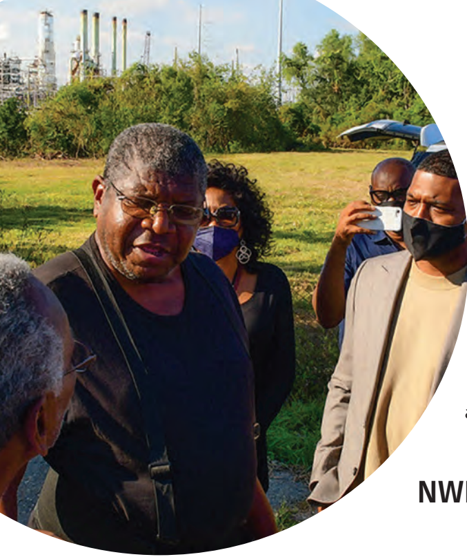
EPA visits Louisiana communities.